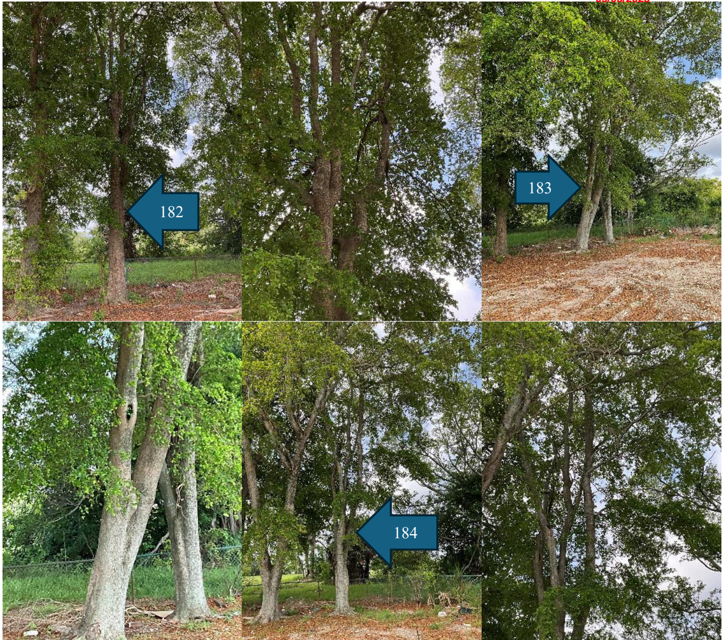
Black Olives ( Bucida buceras ), facing west. Note poor structure, canopy crowding, canopy dieback, deadwood, and mechanical root zone damage for all trees.